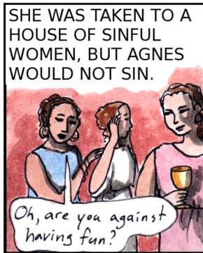
SHE WAS TAKEN TO A HOUSE OF SINFUL WOMEN, BUT AGNES WOULD NOT SIN.