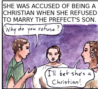
SHE WAS ACCUSED OF BEING A CHRISTIAN WHEN SHE REFUSED TO MARRY THE PREFECT'S SON.

Why do you refuse? I'll bet she's a Christian!