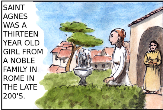
SAINT AGNES WAS A THIRTEEN YEAR OLD GIRL FROM A NOBLE FAMILY IN ROME IN THE LATE 200'S.