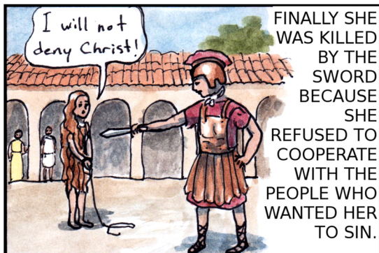
I will not deny Christ!