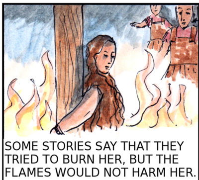
SOME STORIES SAY THAT THEY TRIED TO BURN HER, BUT THE FLAMES WOULD NOT HARM HER.