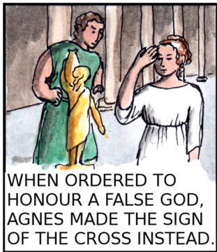
WHEN ORDERED TO HONOUR A FALSE GOD, AGNES MADE THE SIGN OF THE CROSS INSTEAD.

Why do you refuse? I'll bet she's a Christian!