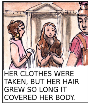
HER CLOTHES WERE TAKEN, BUT HER HAIR GREW SO LONG IT COVERED HER BODY.